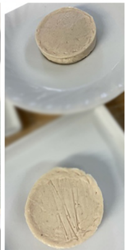
Fruit salad | Salmon | Fish cakes | Mince pies