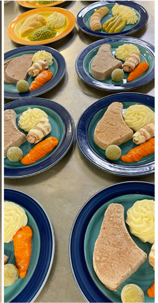
Texture modified Christmas lunch