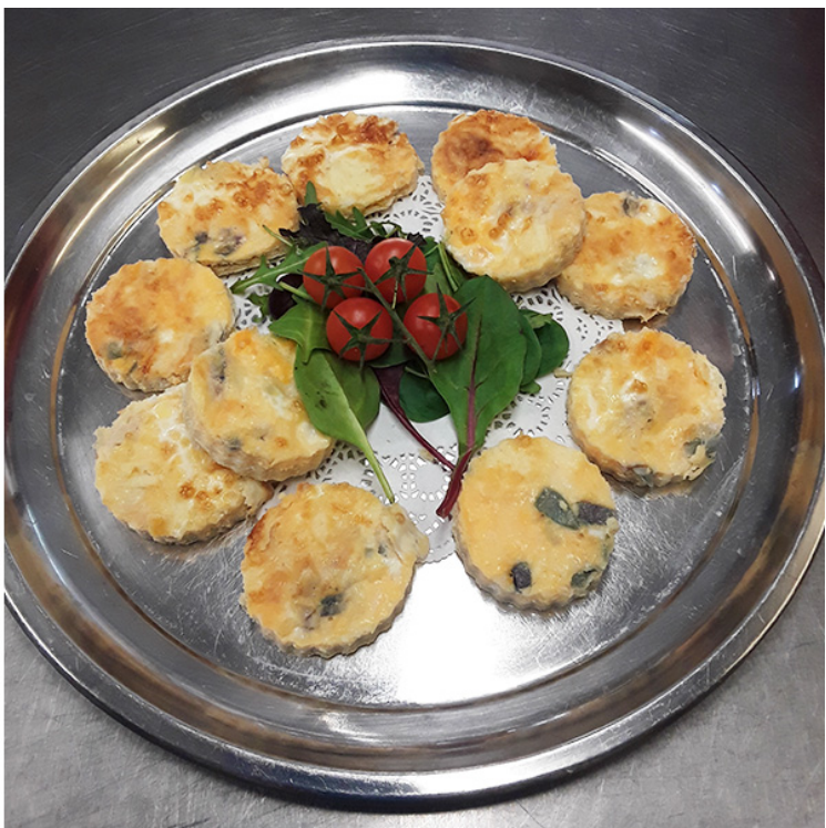
Mouthwatering crudités and savouries