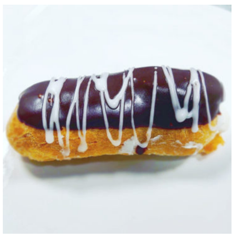
Homemade chocolate and cream eclairs