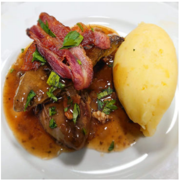
Liver and crispy bacon with mash potatoes