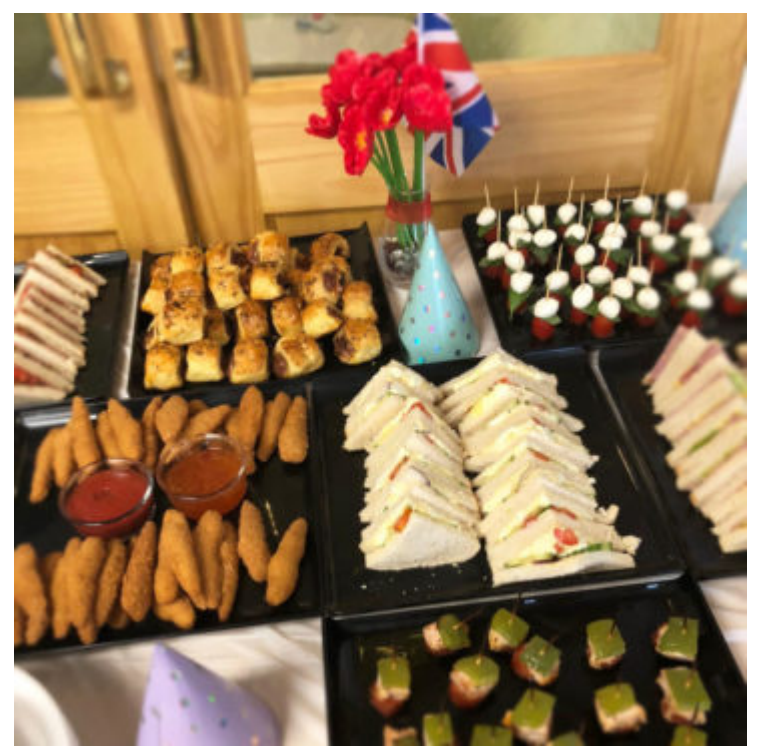
A party buffet for a staff member's leaving do